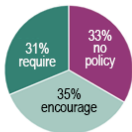
FIGURE 1: FUNDERS WITH OPEN ACCESS PUBLISHING POLICIES